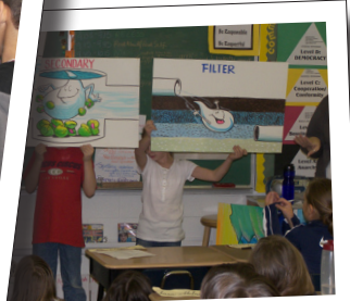
Students learn how wastewater is cleaned so we can use it again.