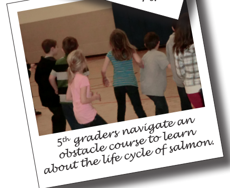
5 th graders navigate an obstacle course to learn about the life cycle of salmon.

Our children = our future. The Board of Directors is committed to assuring that the water quality of our rivers and streams is protected through our sanitary sewer and surface water services. We understand that our activities today lay the foundation for the future. That future will be owned by our children and grandchildren. Through the District's youth education programs, we strive to help students to understand their place in the environment and their role in preserving it for the future.