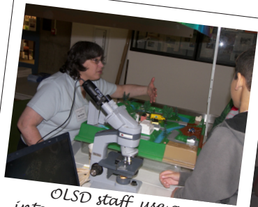
OLSD staff use an interactive model to show what happens when water goes down the drain.

The District welcomes students of all ages! If you are part of a local civic organization, community group, or are just interested in learning more about your water environment, please let us know!