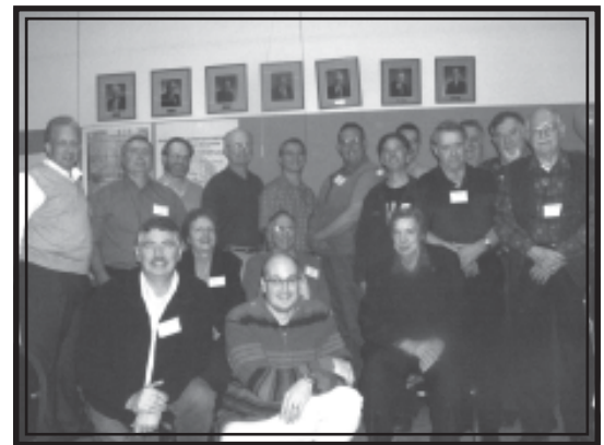
District volunteers at the 2006 Volunteer Recognition Event

Application Deadline: November 30, 2007 . Applicant reviews will be held during the regular Board meeting on December 11, 2007 .